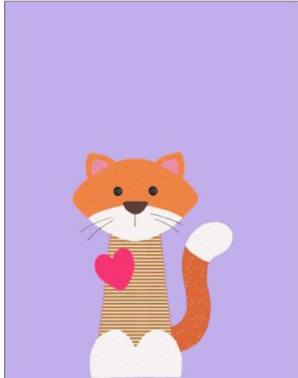
Diagram 1 ▼