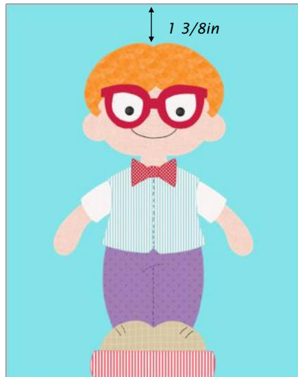
Diagram 1 ▼