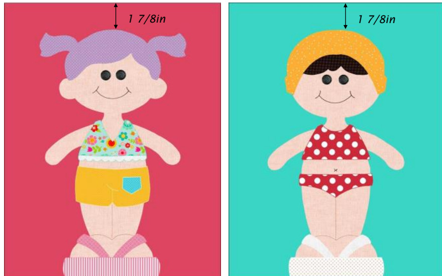
Diagram 1 ▼