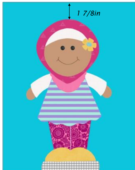
Diagram 1 ▼